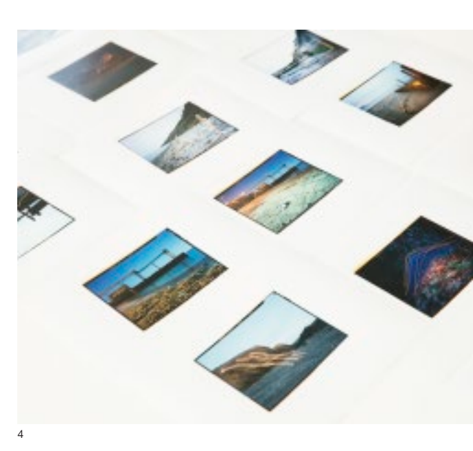
"People love the scenery and gardens but they'll also paint broken nets. I hope I teach people to keep their eyes open for any old rubbish"

The most scenic Scilly is Tresco and the Newlyn School will take you and your paintbrushes there for a few days of relaxing tutelage with Amanda Hoskin, a Cornish artist and a master of landscapes. Board an eight-seater prop-plane from Land's End Airport for the 15-minute hop to St Mary's then sling your easel in a boat for the transfer to New Grimsby, Tresco's scenic little port. Next it's a tractor for your bags and a golf cart for your legs if the island's square mile of fields, beaches and sandy tracks are too much for your artistic temperament. Then sea breeze, gulls on the wing calling across the bay and silence. It feels painterly.